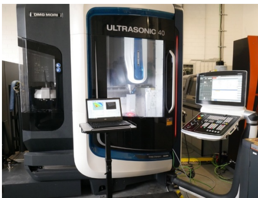
Fig.1: Satellite mirror out of CMC

Final machining is challenging, not only due to the high value of these components but also because of efficiency and cost.