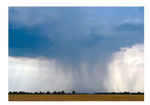
Rain over a wide plain (photography)