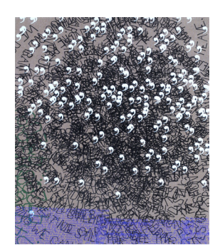
Landscape, Pauline Rebollo (experimental typography)

Rain is a weather phenomenon. If you look closely, you can discover a very special beauty in it. In this design workshop, we will look at these drops of water falling from the sky from a designer's perspective. We will depict the rain using different media and interpret it freely.