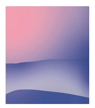
Rain at dawn, Christian Sauer (illustration)