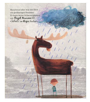
"This Moose belongs to Me" Oliver Jeffers (book illustration)