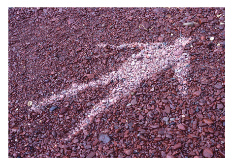
Rain shadow, Andy Goldsworthy (installation)